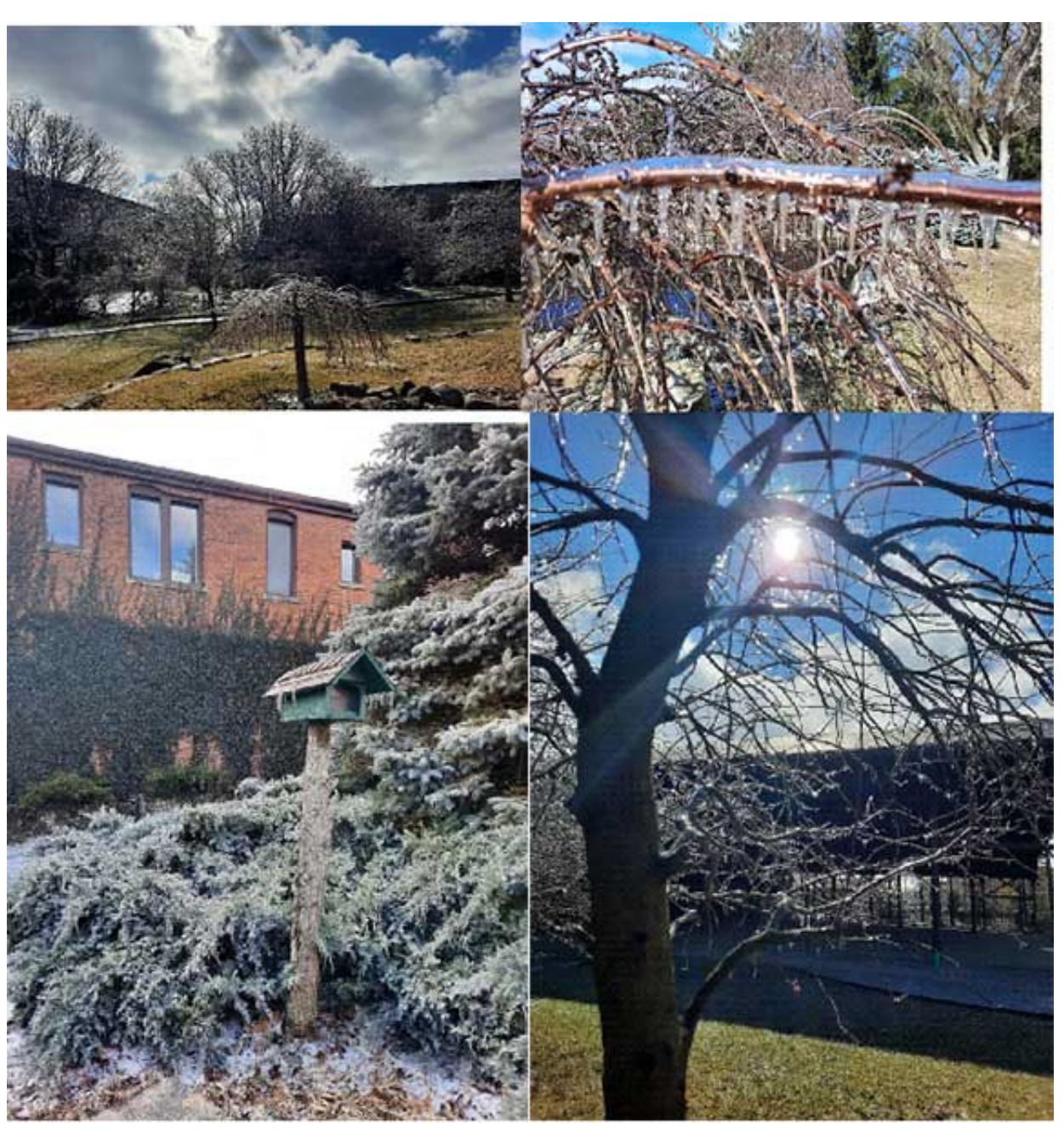
February 26, 2022