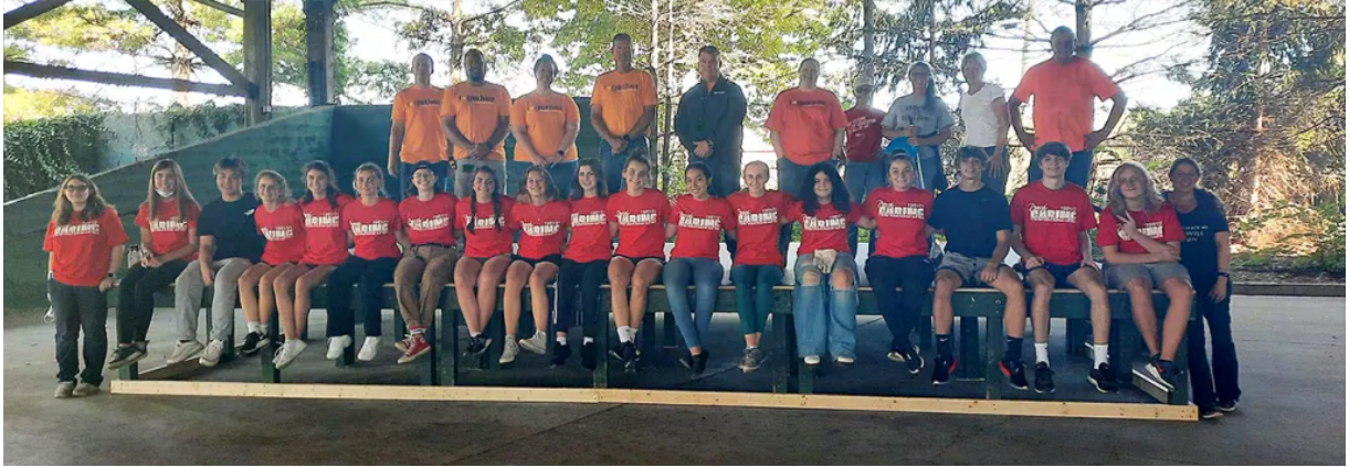
Nine Star and Octagon Club Volunteers